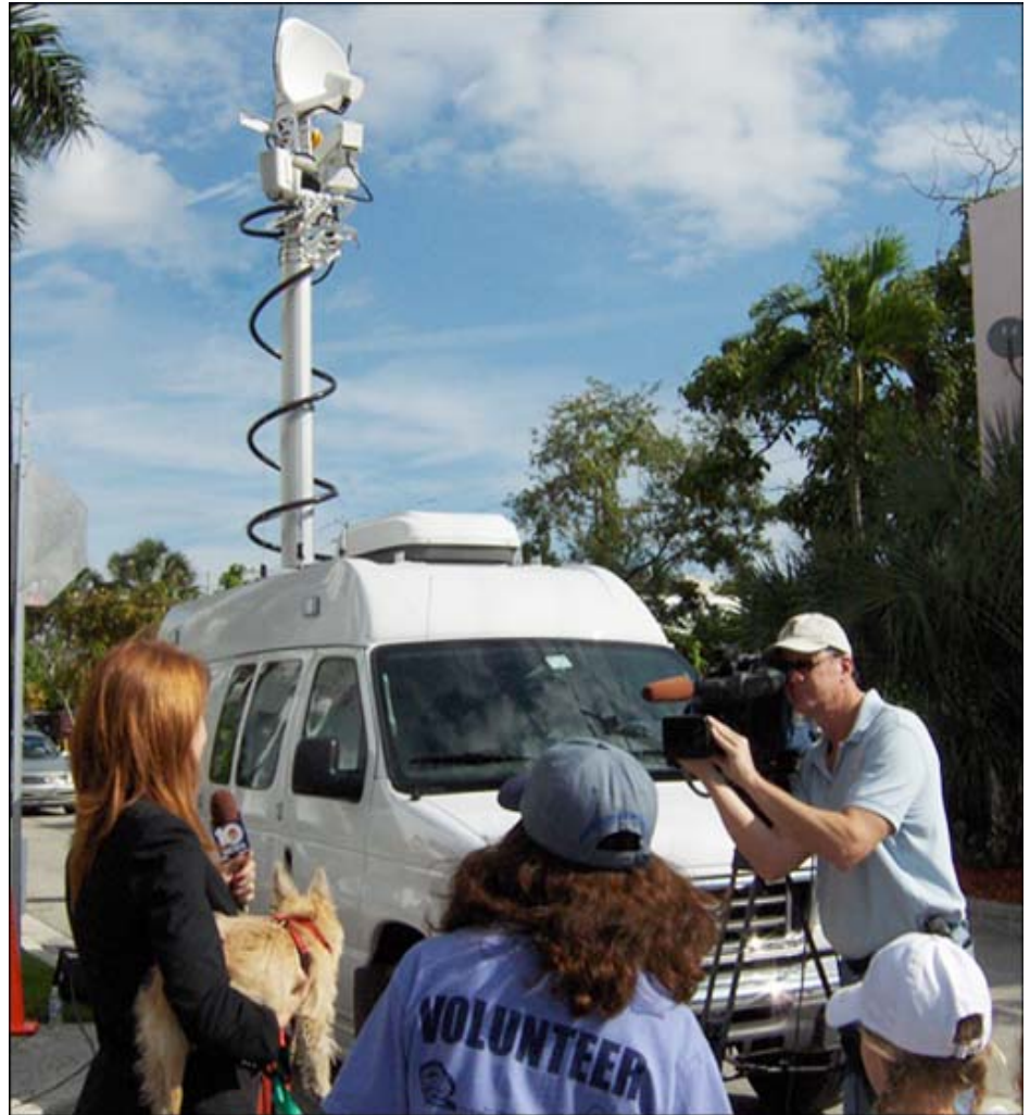
The Silhouette™ is ideal for mast mounted applications.